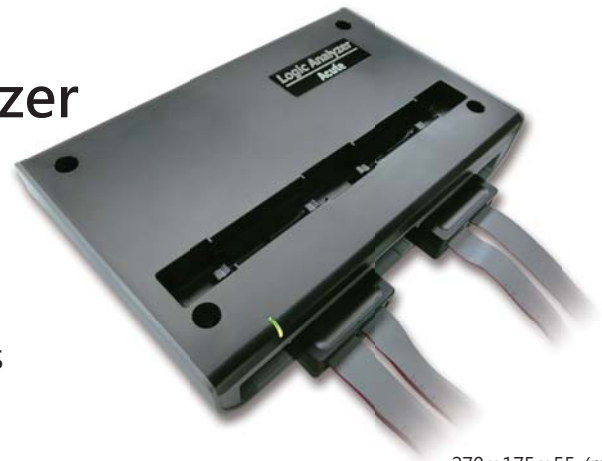
270 x 175 x 55 (mm 3 )